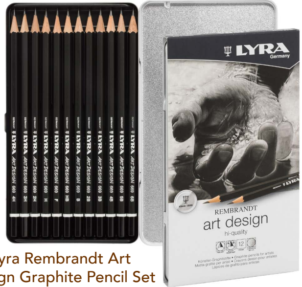
Lyra Rembrandt Art Design Graphite Pencil Set