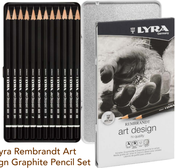
Lyra Rembrandt Art Design Graphite Pencil Set