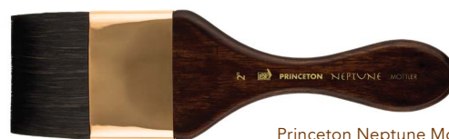
Princeton Neptune Mottler 2"