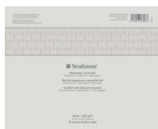
Strathmore Travel Series Watercolor cold press, 100% cotton 8 x 10"